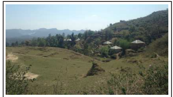
Right: A view of some of the villagers properties