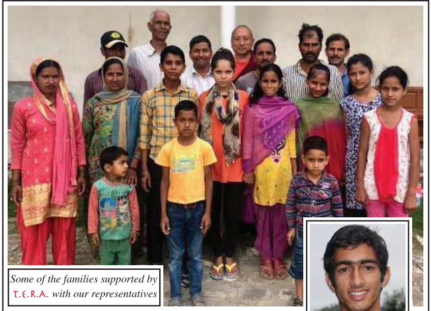
Some of the families supported by T.E.R.A. with our representatives