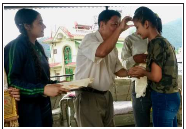
Above: One of our sponsored students about to receive his certificate, Khata & Tika blessing