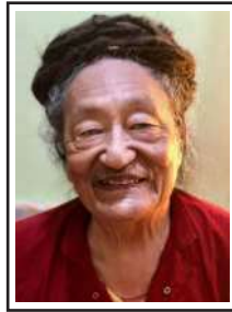
Togden Acho Spirifual Inspiration