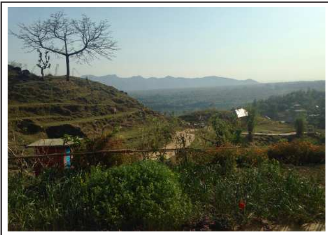
View from one of the properties above Tash Jong of the Kangra Valley